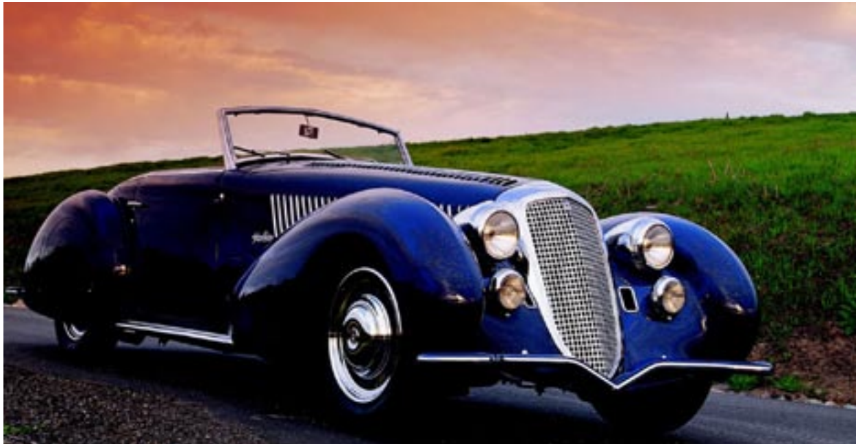
Alfa Romeo 8C 2900B Spyder