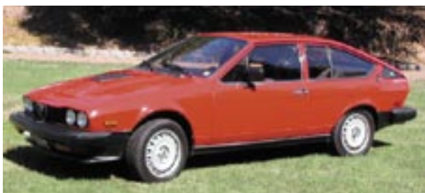
Romeo & Giulietta